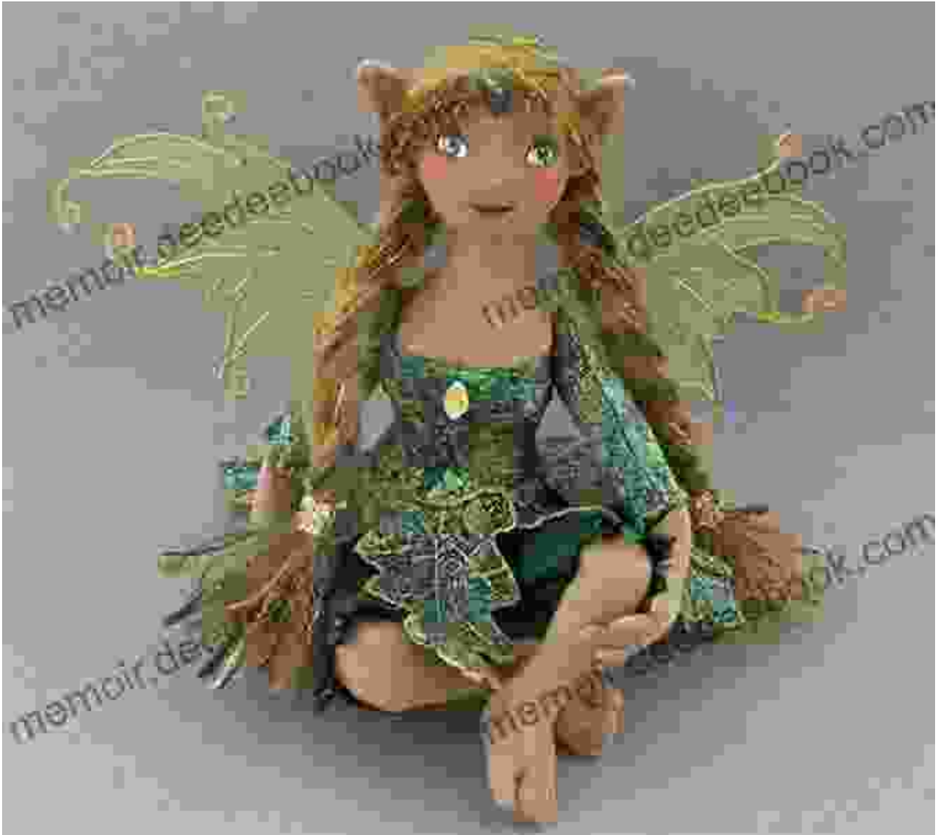
A mischievous woodland fairy, her eyes twinkling with a playful spirit.