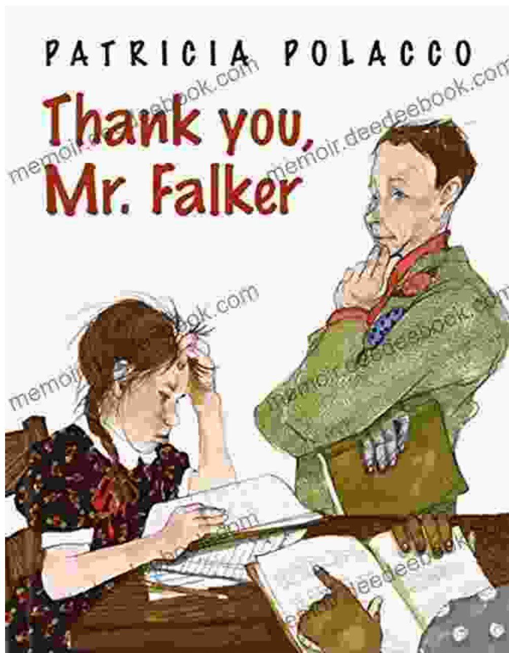
Vera Polacco with her book 'Thank You, Mr. Falker'

Polacco's passion for storytelling and illustration emerged at an early age. She enrolled in the Rhode Island School of Design, where she honed her artistic skills. After graduating, she embarked on a career as a teacher, but her true calling lay in creating books for children.