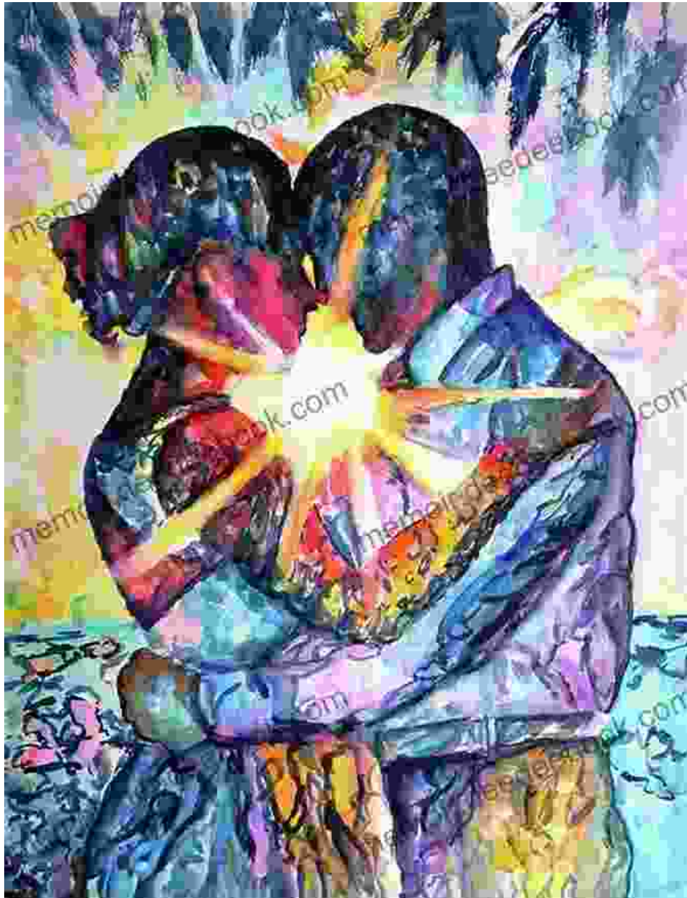
The Enigma of Loss and the Glimmer of Hope

Love, in its boundless glory and agonizing torment, emerges as a central motif. The collection's verses capture the euphoric heights of newfound love, its tender whispers and intoxicating embrace. Yet, they also confront the poignant anguish of heartbreak, the desolate void it leaves behind.