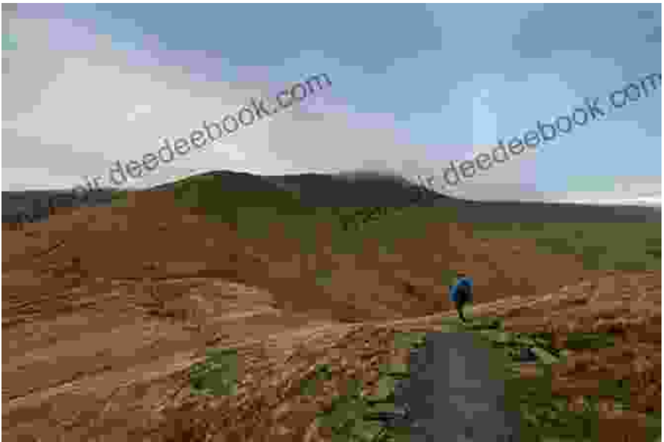
Pen y Fan, the iconic mountain in the heart of South East Wales

Beyond the coastline, South East Wales is home to the majestic Brecon Beacons National Park. This mountainous region is a haven for hikers, climbers, and nature enthusiasts. The highest peak, Pen y Fan, offers panoramic views of the surrounding countryside. The park is also renowned for its waterfalls, caves, and ancient ruins. The Wye Valley, a designated Area of Outstanding Natural Beauty, is another must-visit destination in South East Wales. This picturesque valley features the River Wye, meandering through rolling hills and picturesque villages.